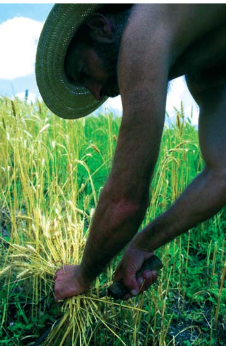
Manual labour: harvesting in Brazil