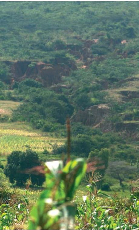
Active landscaping: turning eroded lands into fertile fields