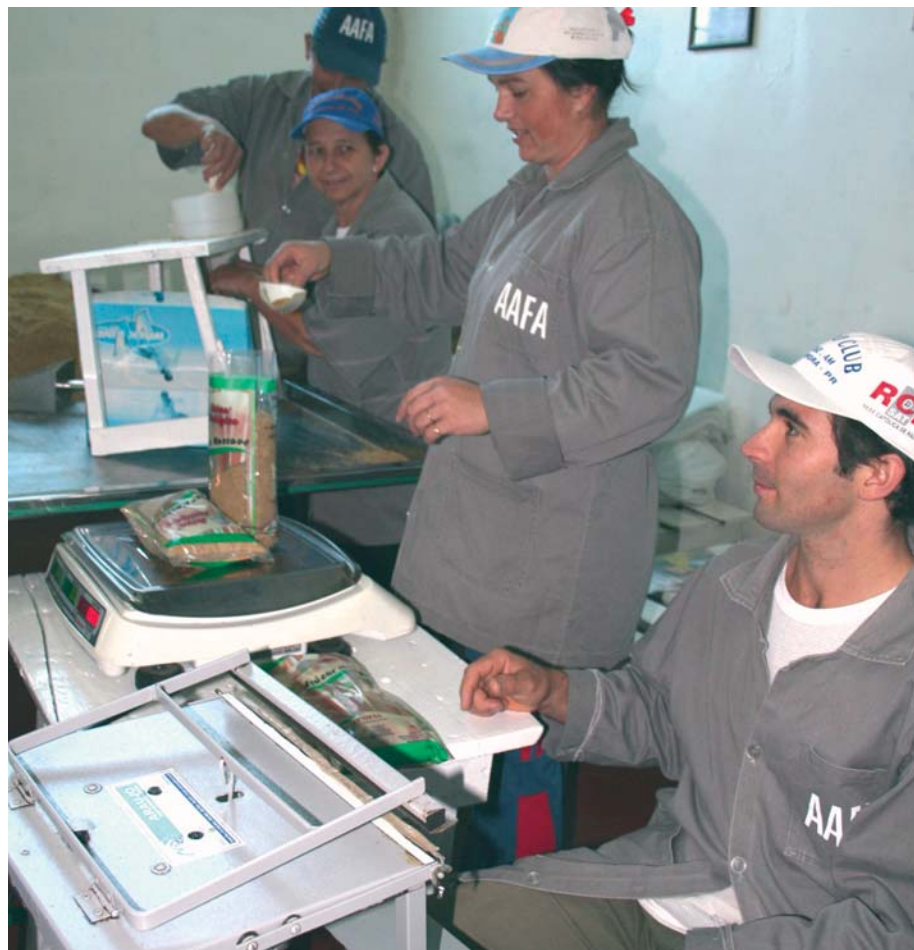
The families of the group AAFA formed a cooperative: the whole production process from harvesting the sugar cane to packaging the brown sugar lies in their own hands

Furthermore they have in common the commitment to ecological farming methods – initially often due to lack of money, but increasingly out of conviction. Instead of monocultures they make use of their local biological diversity. Instead