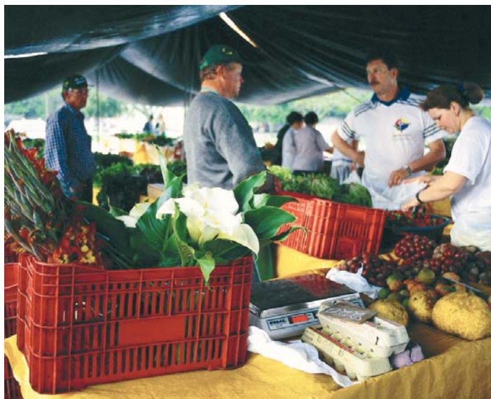
At the weekly Eco-Fair in Pelotas, members of the cooperative sell locally produced organic products: Because production and transport costs are low, customers can buy healthy food at affordable prices