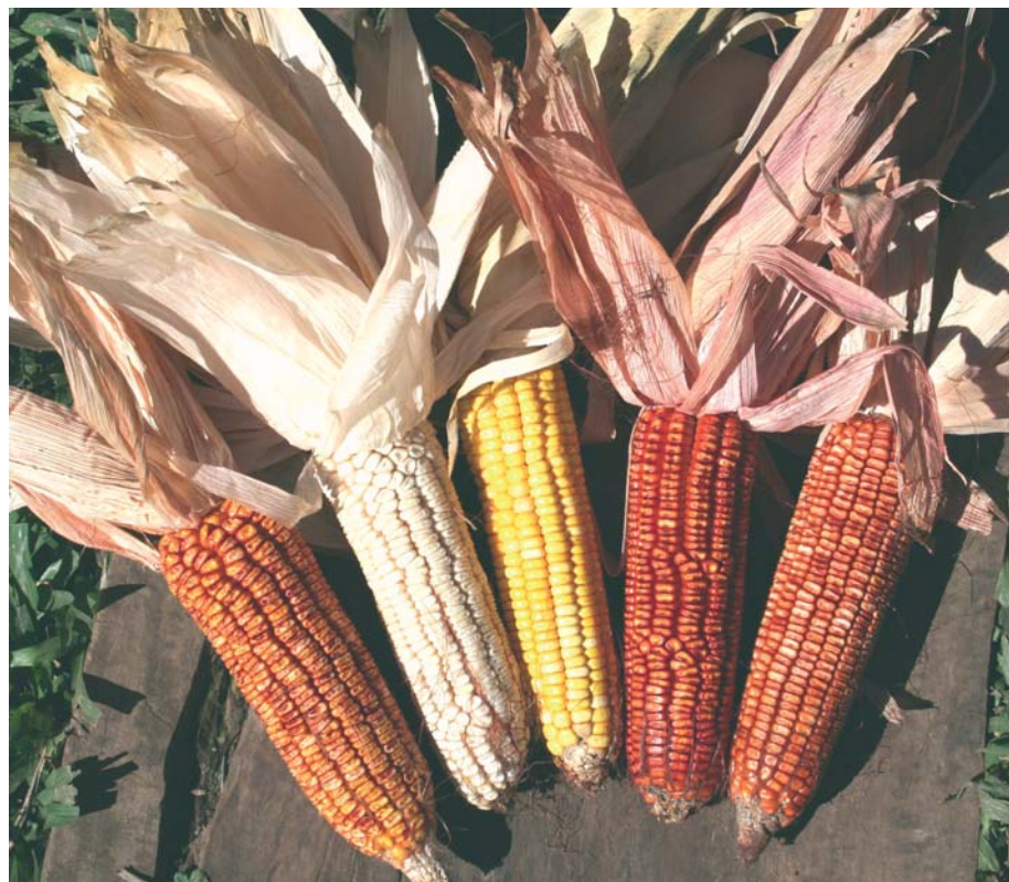
The recovery of traditional farming methods and the use of local varieties conserves biological diversity

There have been some signs of the rediscovery of agriculture by bilateral and multilateral development organizations in the past four to five years. The World Development Report 2008, published by the World Bank is a kind of flagship publication in development discussions, covered the issue of agriculture for the first time since 25 years. A comprehensive new strategy is supposed to promote economic growth and reduce poverty and food insecurity. Governments have promised to increase expenditures for agriculture up to at least 10 % of the national budget in Africa. For