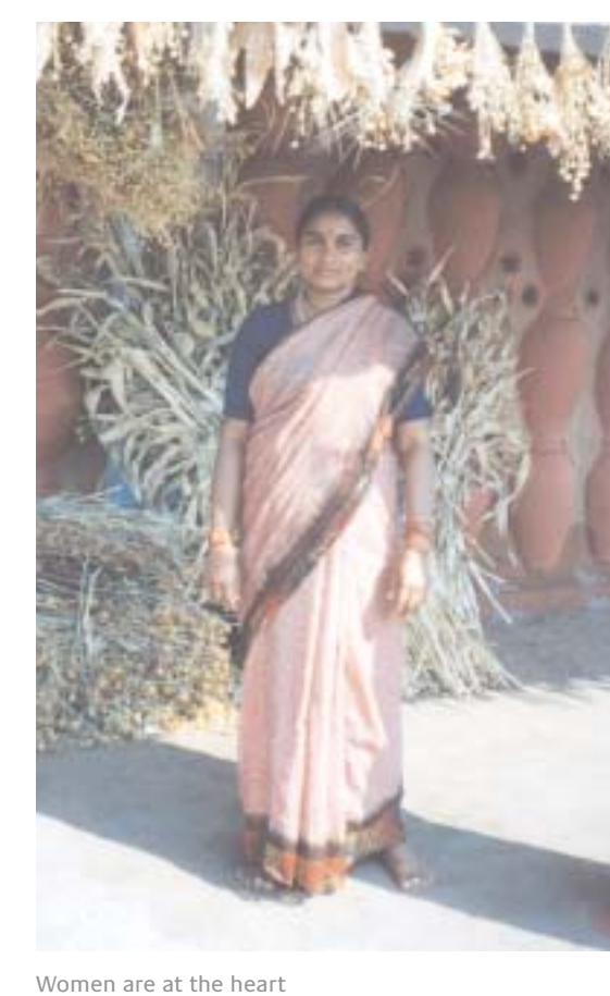
of maintaining and further developing the foundations of food and health.