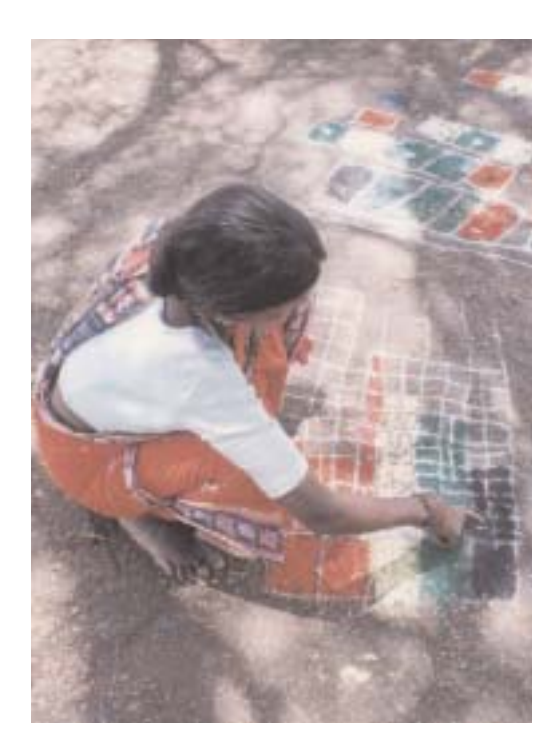
With simple methods, knowledge about the cultivation, processing and properties of the plants is collected.

bio-piracy as well as to obtain means for their own development.