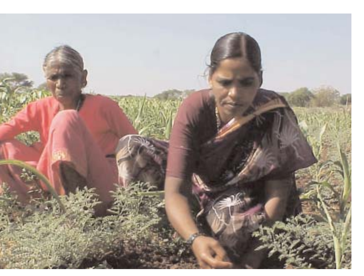
Manual labour instead of herbicides – women from Krishnapur weeding.

"As the large companies and market forces took over the agricultural market, they margi-