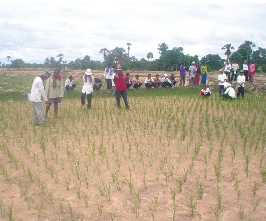
Field visit: Transplanting fewer seedlings and leaving more space in between increases yields. The new method has been proven in practice to be successful, but sceptics still stick to their objections.

Around the house there are rice fields as far as one can see, crisscrossed by bunds that function as footpaths between the other houses, looking like islands in the vast sea of yellow paddy fields. The village lies in the fertile plains along the Mekong River with a long tradition of rice growing. There are 1.7 million rice-farming households in Cambodia. More than 70 per cent of Cambodia's workforce depends on agriculture. Rice is the basis of their livelihood and their lives, structuring the course of the year. And when they learn that in Germany there is neither rice growing nor the habit of eating rice three times a day, they shake their heads in disbelief. Yi Em, a female farmer keenly interested in German agriculture, asks, "Are you so poor that you can't afford it?"